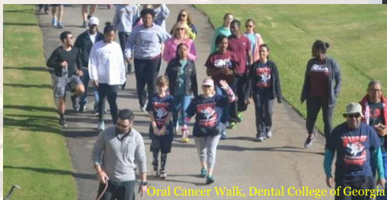
Oral Cancer Walk, Dental College of Georgia