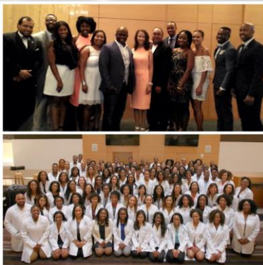
Rites of Passage Ceremony & White Coat Photo

I would say that all of the above depicts success, and the only direction to continue going is up! As you all may know, it is our goal to better serve you each year, and provide a number of resources for you all at each annual convention.