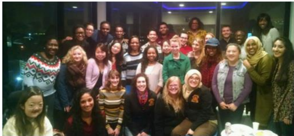
Top left, SNDA members at the fall grill-out social. Top right, SNDA members serving breakfast to dispensing and assisting staff. Bottom, SNDA and SNMA members at Friends-giving.