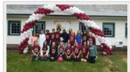
Group photo of participants in the Oral Cancer Walk.

On Sunday, September 18 th , SNDA members participated in the 9 th annual Oral Cancer Walk. This event was held to